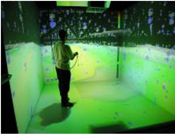
Fig. 3. Full VE view of an atmospheric simulation of a large snow and ice storm