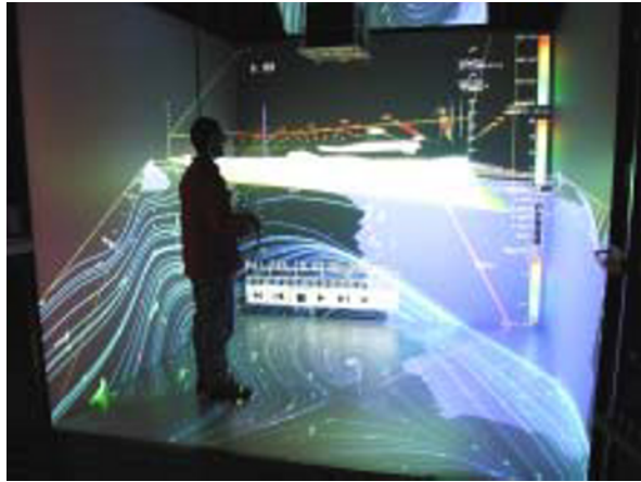
Fig. 4. Full VE view of oceanographic and atmospheric flow data visualized simultaneously

Virtual Environments (VE's) provide advantages over conventional displays for fluid flow analysis. The stream lines for the GT Race Car (Fig. 1) are pre-computed by a flow-solver using a large volumetric model. The oceanographic flow data is model-generated and visualized by our VE software, Triton II (Fig. 2). These top two figures illustrate VE simulators for conventional displays. Certain atmospheric models predict the development and movement of water particles for storms (Fig. 3), while newer systems simultaneously run oceanographic and atmospheric models utilizing each other's boundary conditions (Fig. 4). The last two figures exemplify VE visualization hardware to show how the superior view can provide improved analysis.